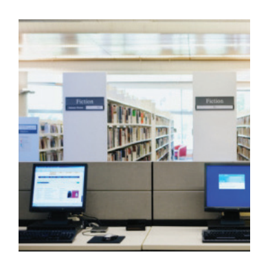
Archiving little-used materials off site gives you more usable on-site space.