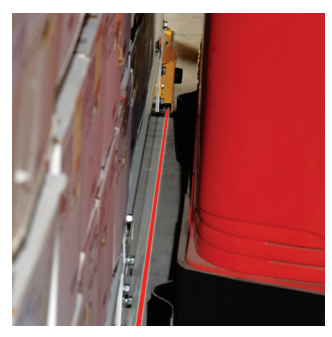
A Photo Sweep® stretches the full length of each carriage side for end-to-end safety.

During seismic tremors, an overhead anti-tip system keeps the XTend system standing and stored materials secure.