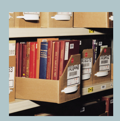
With an XTend system, you're assured that your rare or valuable materials are safely archived and thoroughly protected.