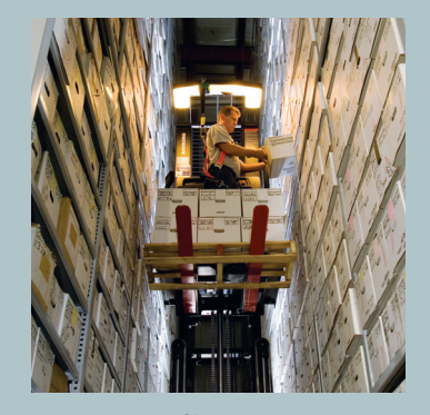
From totes to file boxes to records boxes, an XTend system accommodates a variety of storage containers easily and efficiently.