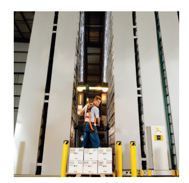
An XTend Mobile High-Bay Storage System lets you use off-site storage space more efficiently.

The result: Unprecedented levels of off-site storage density, space efficiency and cost effectiveness. The ability to store large volumes of materials or records off site and still maintain appropriate access to them. And the freedom to utilize valuable on-site space for more useful or profitable purposes.