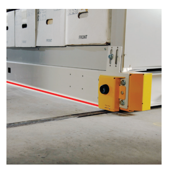
Photo Sweeps are standard safety equipment on all XTend Mobile High-Bay Storage Systems.

High on space efficiency, simplicity and safety, an XTend Mobile High-Bay Storage System from Spacesaver may well be your best choice for off-site storage compared to other available options.