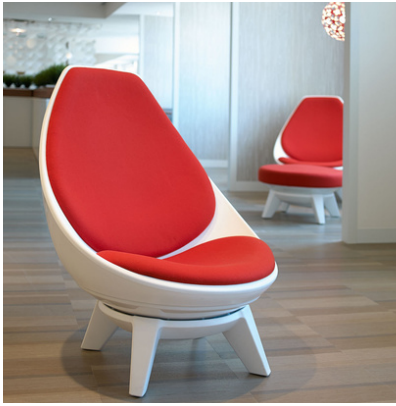
SWAY LOUNGE SEATING