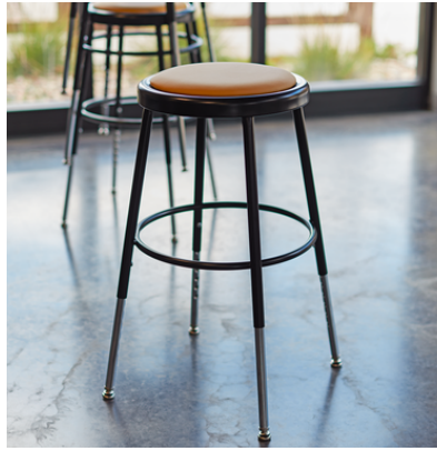
600 INDUSTRIAL STOOL