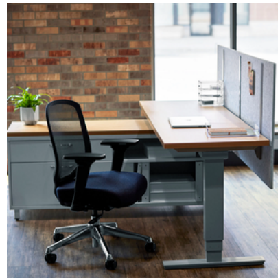
TOGGLE HEIGHT ADJUSTABLE TABLES