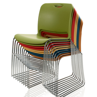
MAESTRO STACK SEATING