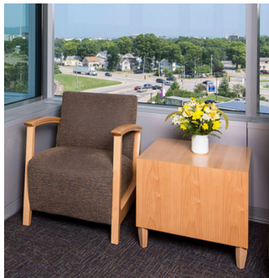
SOLTICE LOUNGE COLLECTION