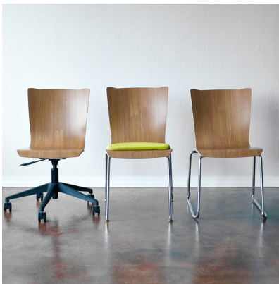
APPLY SEATING COLLECTION