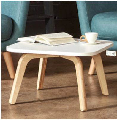
CALIDA OCCASIONAL TABLES