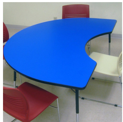
INTELLECT ACTIVITY TABLES