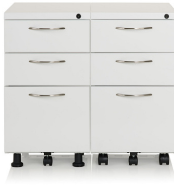
U-SERIES FILES & STORAGE