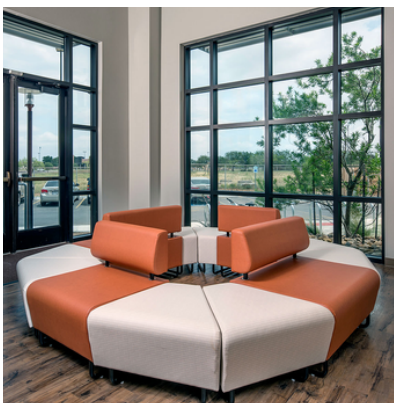
HUB MODULAR SEATING COLLECTION