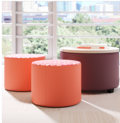
MYPLACE OCCASIONAL TABLES