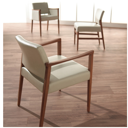
AFFINA GUEST CHAIR