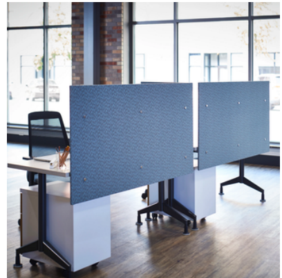
UNIVERSAL ADJUSTABLE SCREENS