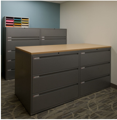
700 SERIES FILES & STORAGE