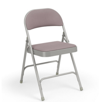
600 FOLDING CHAIR