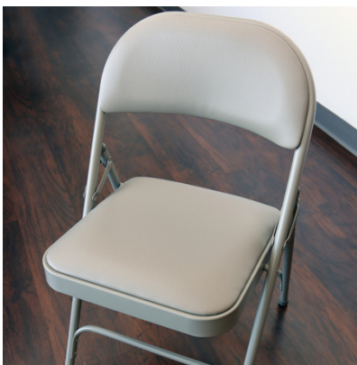
400 FOLDING CHAIR