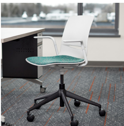
LIMELITE SEATING COLLECTION