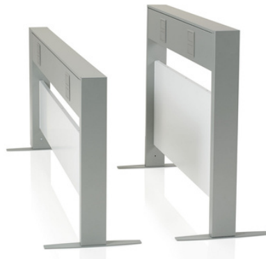
TRELLIS MODULAR POWER SYSTEM