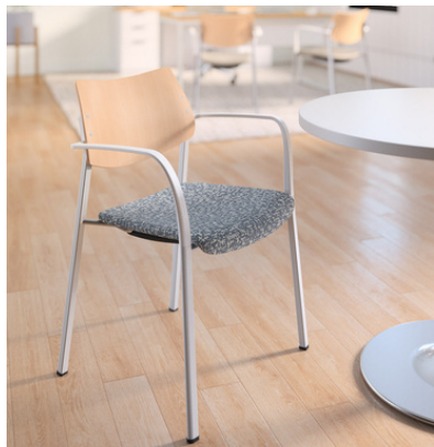
KATERA GUEST CHAIR