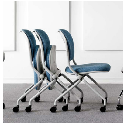
TORSION ON THE GO!