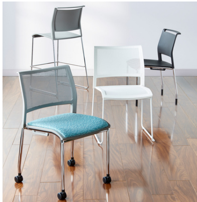
OPT4 STACK SEATING & STOOLS