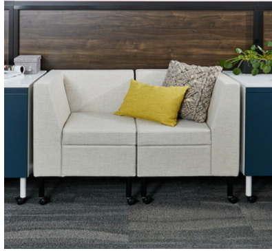
TATTOO SLIM SEATING