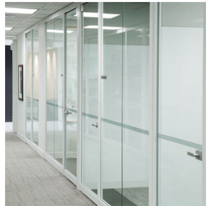
LIGHTLINE ARCHITECTURAL WALL