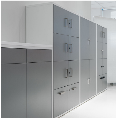
CONNECTION ZONE STORAGE