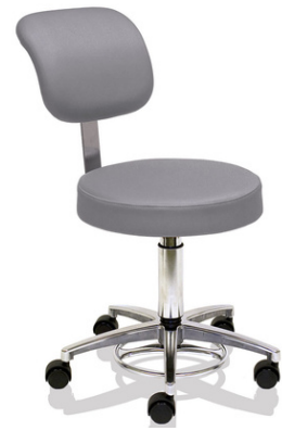
MEDICAL & LAB STOOL