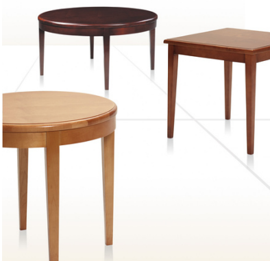
FLEX OCCASIONAL TABLES