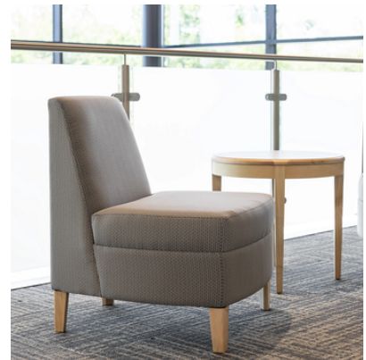
AFFINA LOUNGE COLLECTION