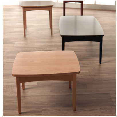
AFFINA OCCASIONAL TABLES