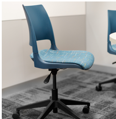
DONI SEATING COLLECTION