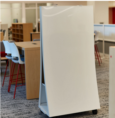
CONNECTION ZONE MOBILE SCREENS