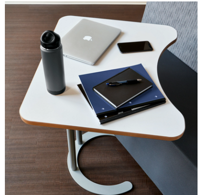
C-TABLE PERSONAL WORKSURFACE