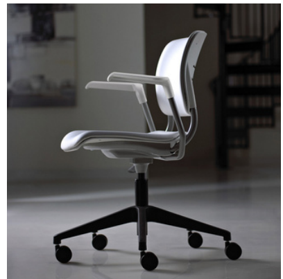
GRAZIE SEATING COLLECTION