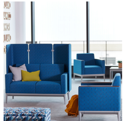
ZOETRY LOUNGE COLLECTION