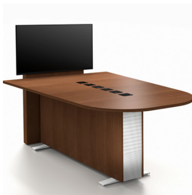
BACKBONE MEDIA PLATFORM