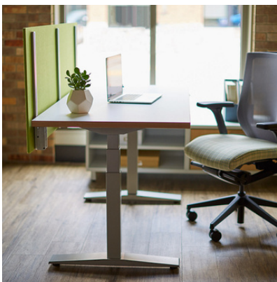
WORKUP HEIGHT ADJUSTABLE TABLES