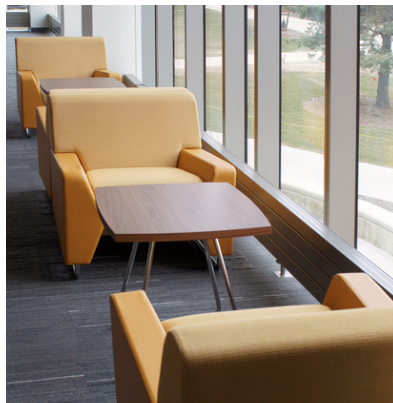
MYWAY LOUNGE COLLECTION