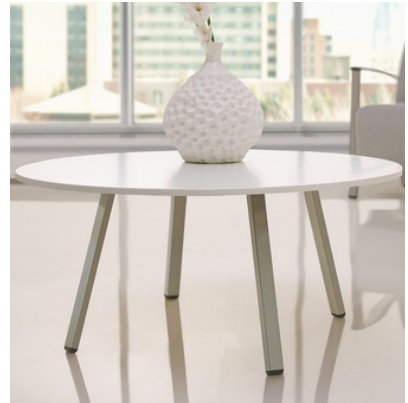
SOLTICE METAL OCCASIONAL TABLES