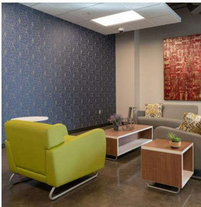
SELA LOUNGE SEATING