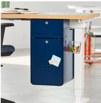
BOBBR UNDERMOUNT STORAGE