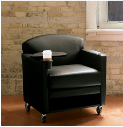
JESSA LOUNGE SEATING