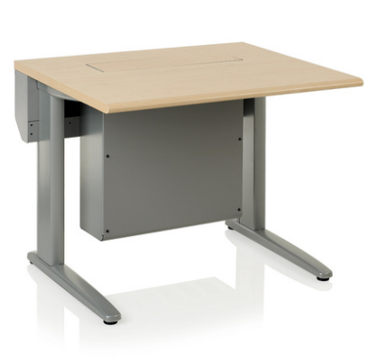
SMART LIFT TABLES