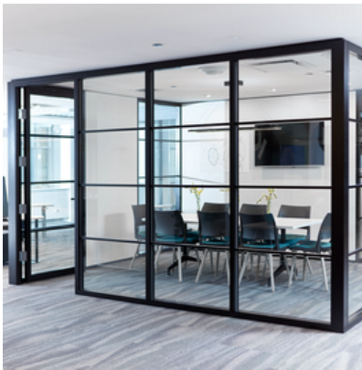
GENIUS ARCHITECTURAL WALL