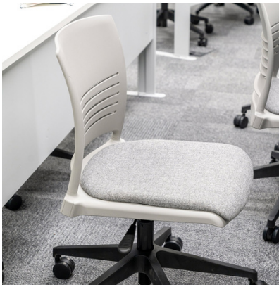
STRIVE SEATING COLLECTION