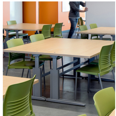
GENESIS HEIGHT ADJUSTABLE DESKING