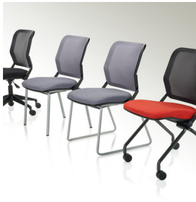
TORSION AIR SEATING COLLECTION