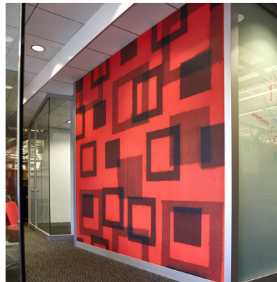
EVOKE ARCHITECTURAL WALL