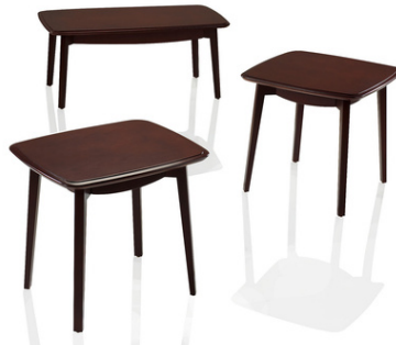
SOLTICE OCCASIONAL TABLES