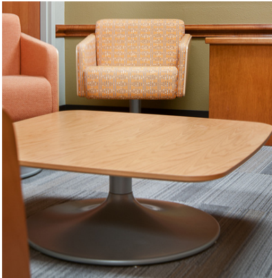
LYRA OCCASIONAL TABLES