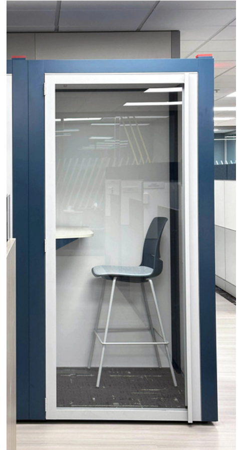
WIGGLEROOM SUPERSTRUCTURE & PODS