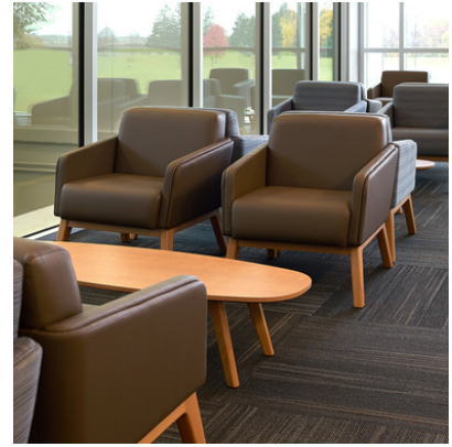
LYRA LOUNGE SEATING