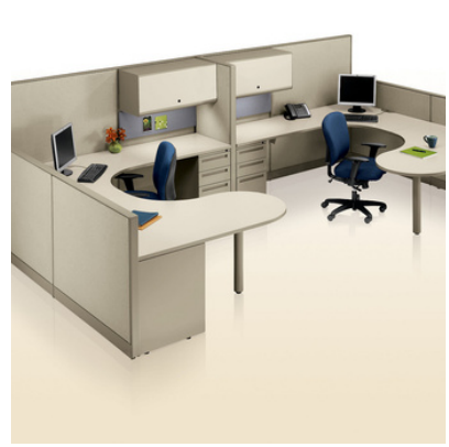
SYSTEM 3000 PANEL SYSTEM