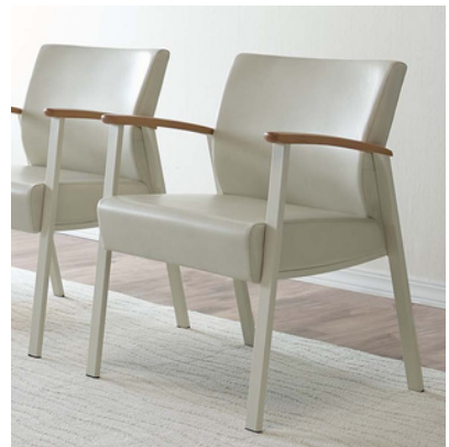
SOLTICE METAL GUEST CHAIR