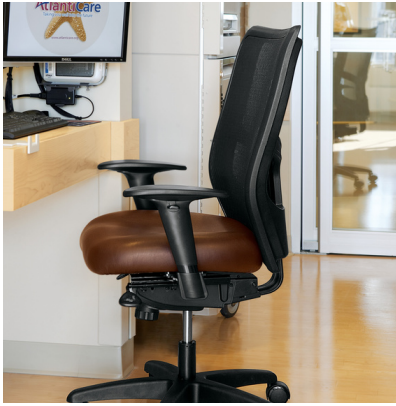
IMPRESS ULTRA TASK