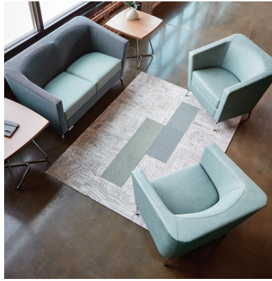
JUBILEE LOUNGE SEATING