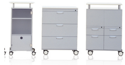
ALL TERRAIN FILES & STORAGE