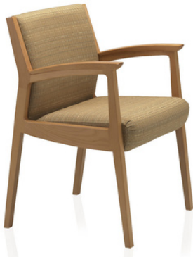
SOLTICE GUEST CHAIR