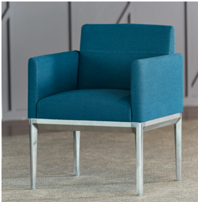
ZOETRY GUEST CHAIR