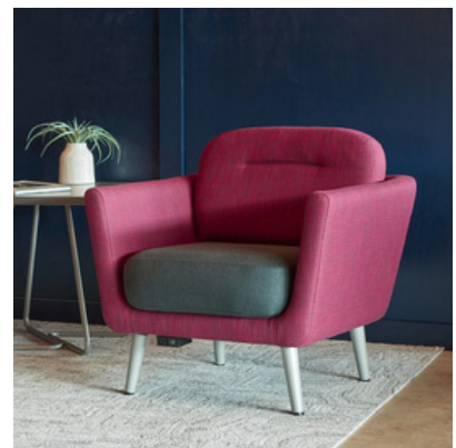
GLADLY LOUNGE CHAIR