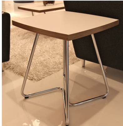
MYWAY OCCASIONAL TABLES