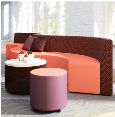
MYPLACE LOUNGE COLLECTION