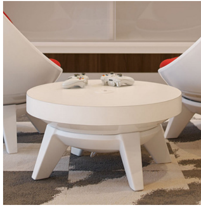
SWAY OCCASIONAL TABLES