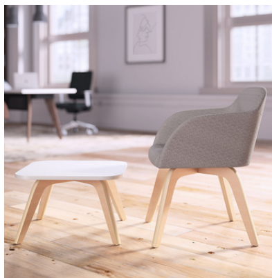
CALIDA LOUNGE FURNITURE