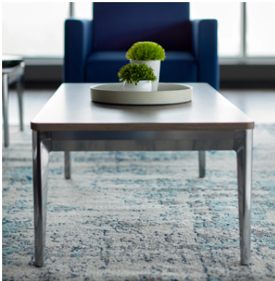
ZOETRY OCCASIONAL TABLES