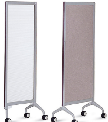
ALL TERRAIN MOBILE SCREENS