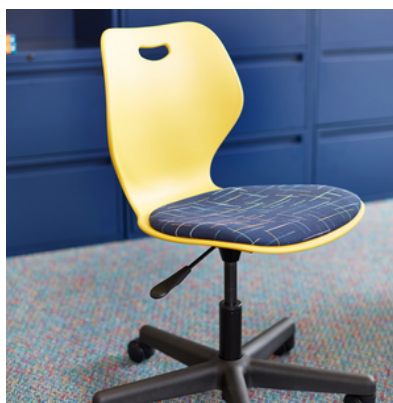
INTELLECT WAVE TASK