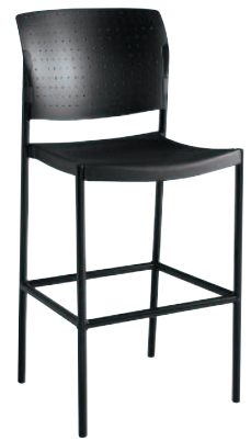
Rapture® S high design | sculpted comfort | lasting value