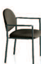
Versa Conference Stack