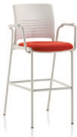
Strive® F simple | comfortable | affordable