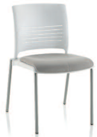
Strive® MF versatile | comfortable | affordable Designed by Giancarlo Piretti