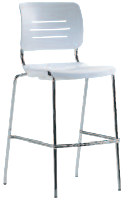
Grazie® F comfort | timeless design | complete collection