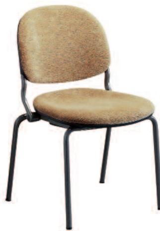
Torsion® MF flex comfort | elegance | durability Designed by Giancarlo Piretti