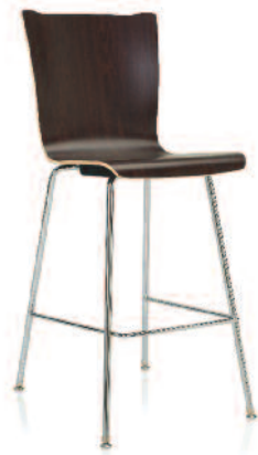
Apply™ S elegant | contoured | durable