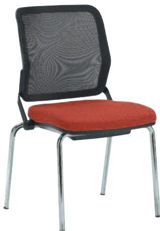
Torsion Air® MF cool | contemporary | comfortable Designed by Giancarlo Piretti