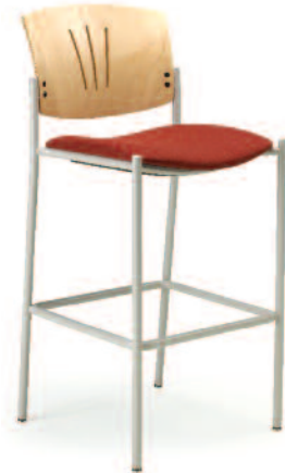
Versa® S clean design | modest price | adaptable