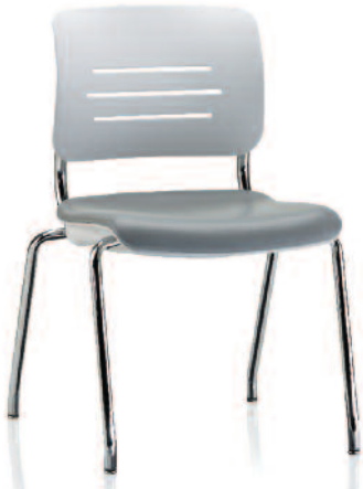
Grazie® MF comfort | timeless design | complete collection Designed by Giancarlo Piretti