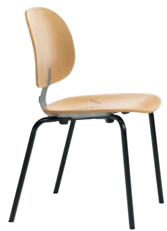
Xylon® MF elegance | comfort | refined style Designed by Giancarlo Piretti