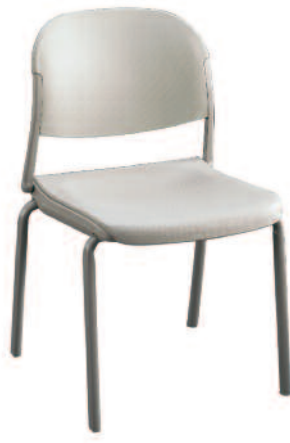
Piretti Stack MF responsive comfort | clean look | durability Designed by Giancarlo Piretti