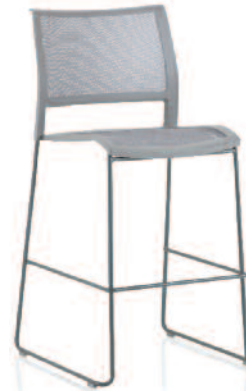
Opt4® S mix and match | light weight | mesh comfort