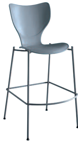
Silhouette® S sophisticated | comfortable | adaptable