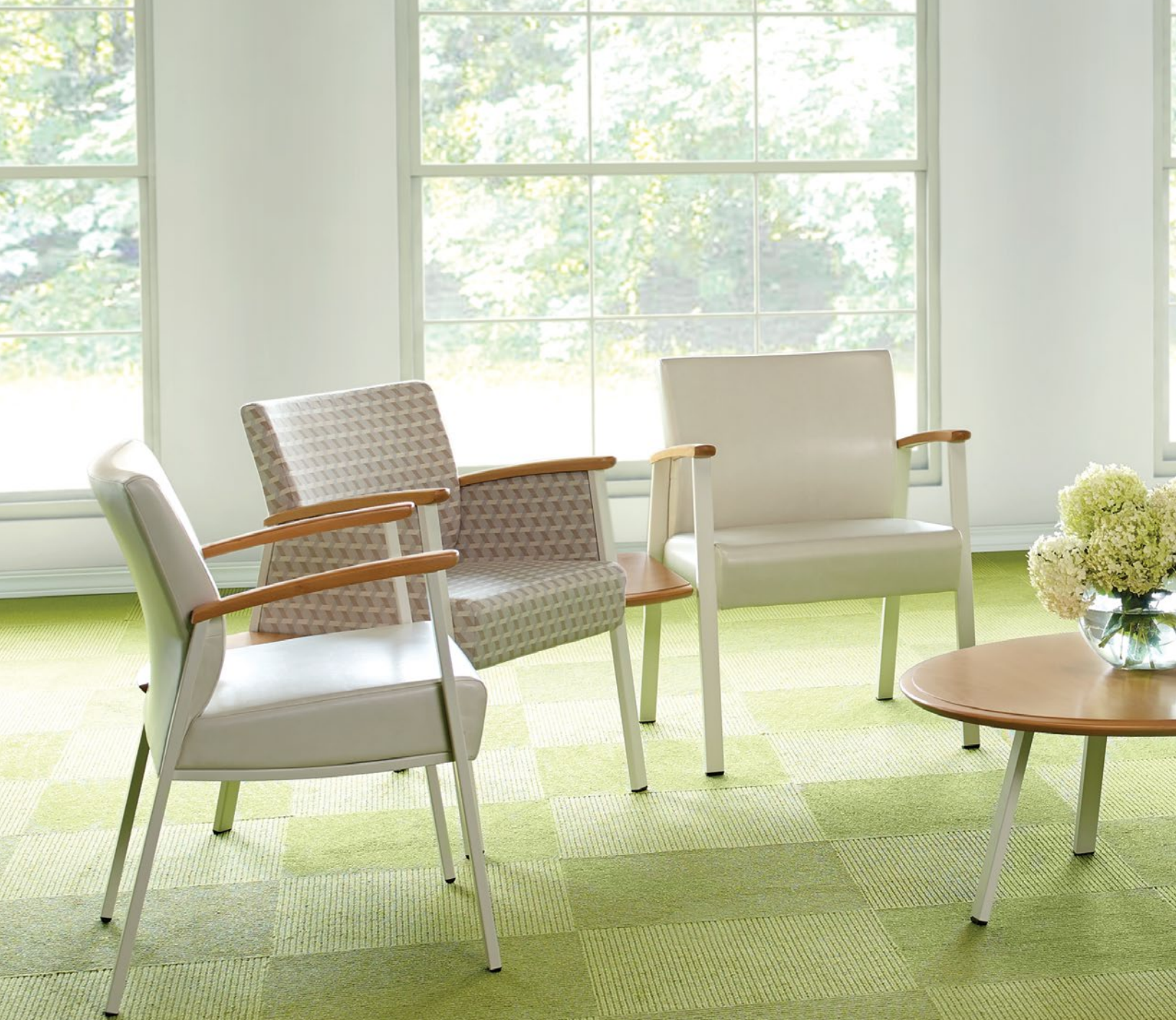
TOP: Multiple seating in Pallas® Textiles' Heritage Blonde Bombshell and Mosaic Opal; Monticello Maple on Beech arm caps and connecting and coffee tables; Wet Sand frames. BOTTOM LEFT: Motion-back patient chair in Pallas® Textiles' Terra Opal (back & arms) and Terra Emerald (seat & ottoman); Sand frame; Sand poly arm caps. Dante cabinet in Biltmore Cherry. BOTTOM CENTER: Fixed-back patient chair in Pallas® Textiles' Terra Opal; Sand frame; Sand poly arm caps. Table in Cinnamon on Beech with Sand frame. BOTTOM RIGHT: Multiple seating in Pallas® Textiles' Urbanized Springtime (backs), Sandstone Light Emerald (seats); Cinnamon on Beech arm caps and connecting and coffee tables; Sand frames.

Minimalistic in its design approach, Soltice Metal maximizes purposeful form and function, resulting in a supportive solution for a variety of high-performance environments.